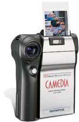
Olympus Camedia Camera. Digital .... and Polaroid film!